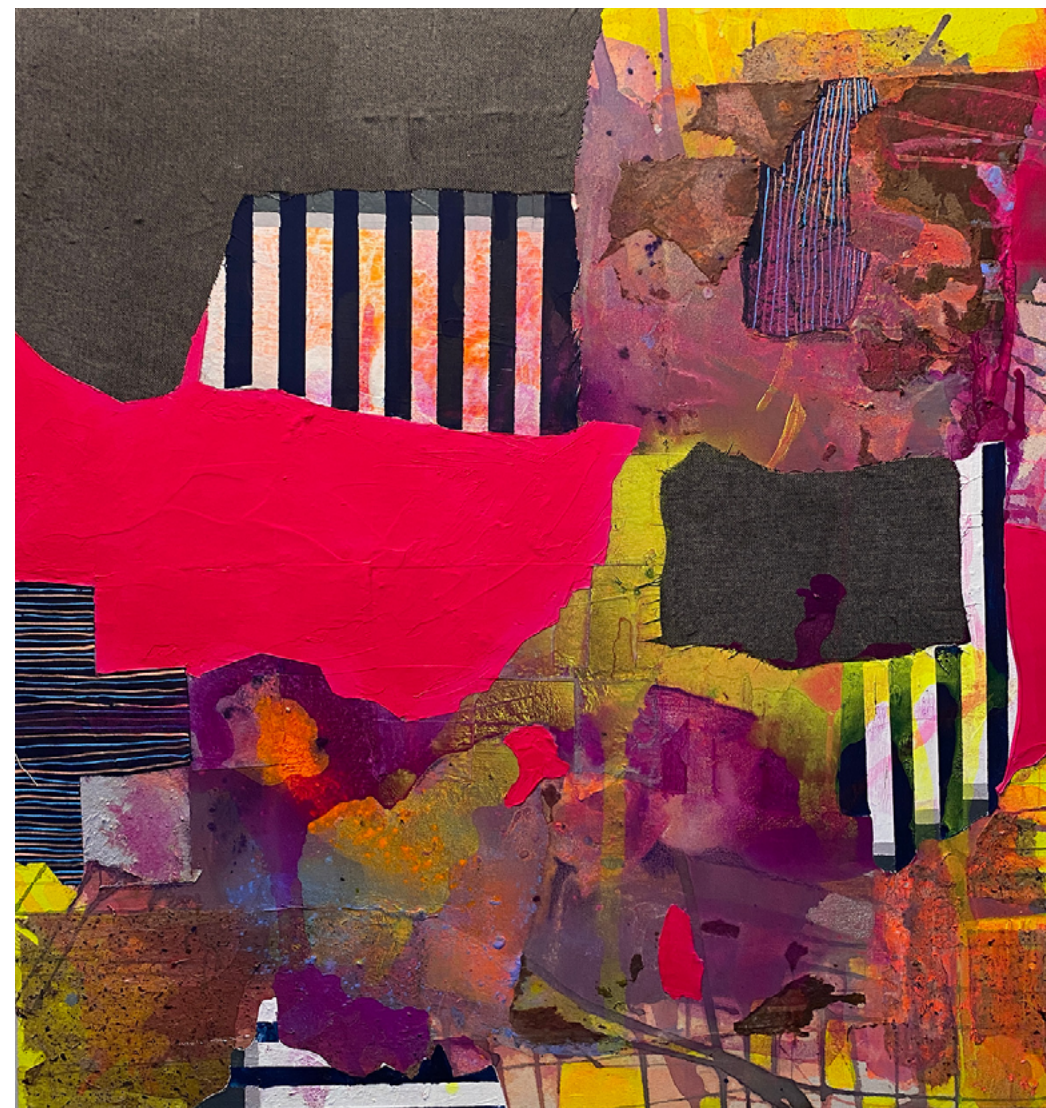
Finding Space #6, 2023 Acrylic, markers, crayons, flashe, paper and fabric on canvas 42 x 40 inches