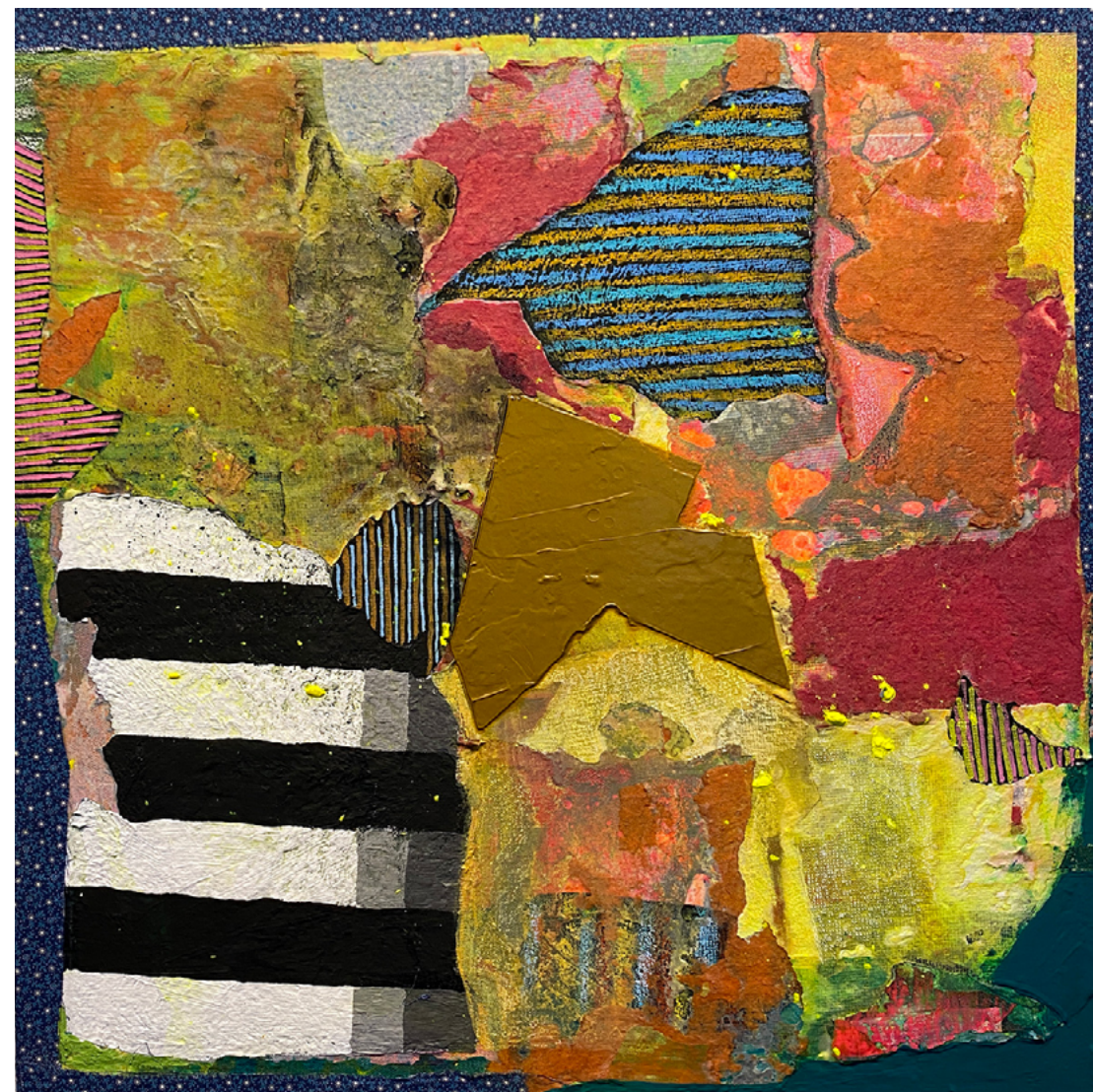
Finding Space #1, 2023 Acrylic, markers, crayons, flashe, paper and fabric on canvas 20 x 20 inches