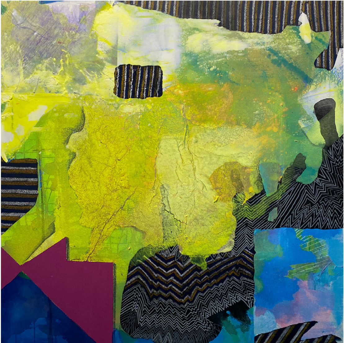
Finding Space #5, 2023 Acrylic, crayons, flashe and paper on canvas 40 x 40 inches